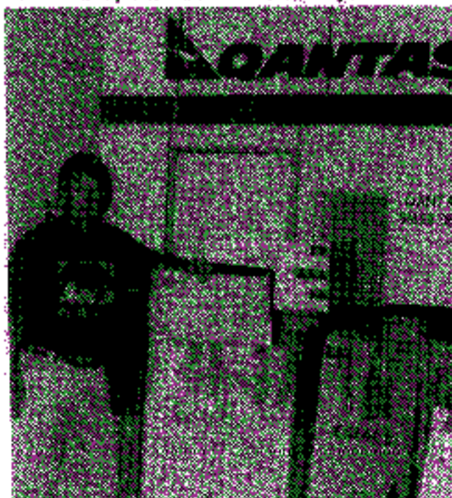
Yet more assistance from our major sponsor — Qantas.

The fact that five rhino were killed earlier this year in private sanctuaries raises the question of how to prevent this slaughter. SAVE believes that the Zimbabwe Government should approve a military approach (similar to that taken by National Parks' anti-poaching patrols operating in the wild), and allow private game scouts to shoot poachers if necessary.