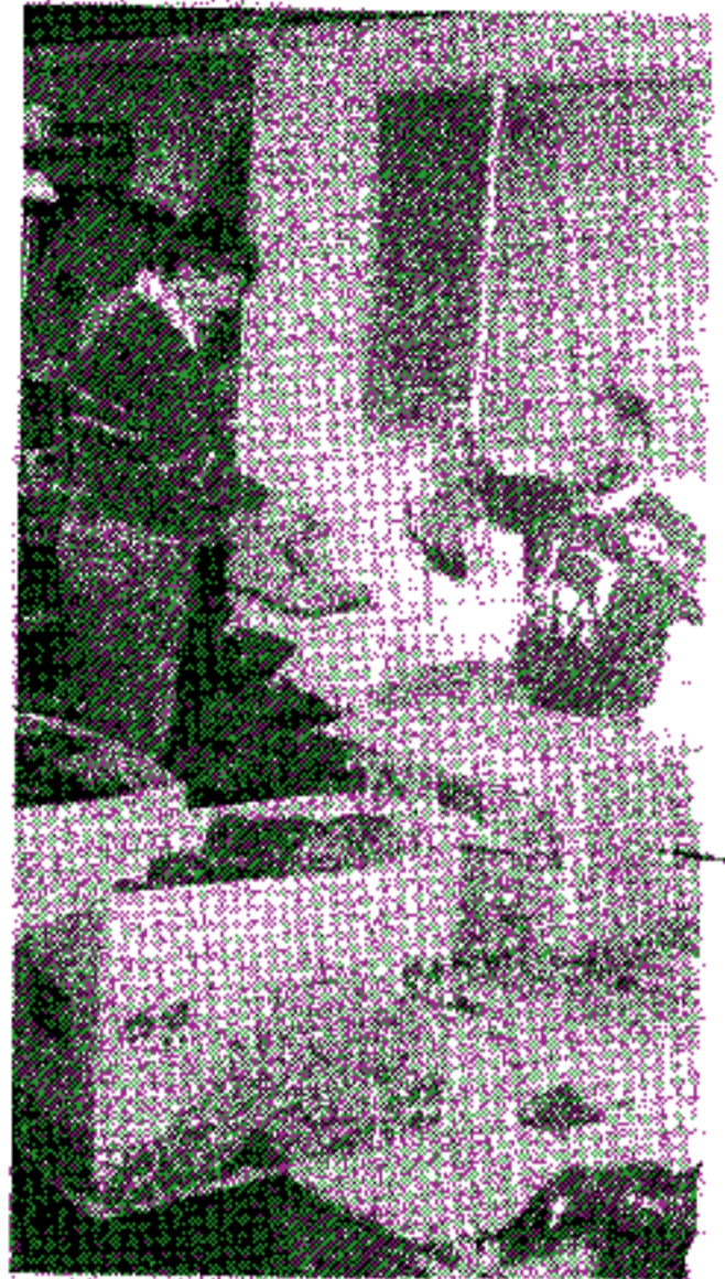
Sorting through 350 pairs of boots.

For two weeks in June, the Australian media will be in Zimbabwe gathering information for various stories on the