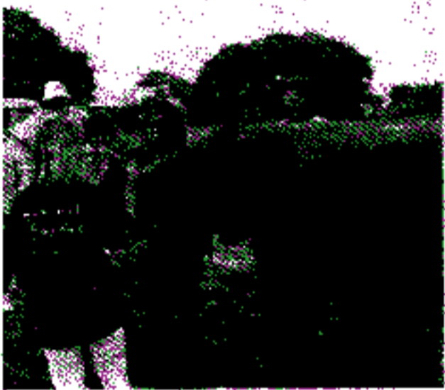
Extinction is forever — but don't tell Tutu.

We spent our first night on African soil at Landela Lodge, a beautiful country guesthouse, just outside Harare, set in a delightful garden of jacarandas and bougainvillea, and close to its own private game park; here we saw sable and kudu, and watched the hand-feeding of Tutu, a young bull elephant.