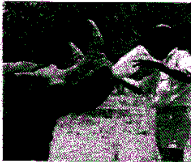
Drink a gallon of milk a day.