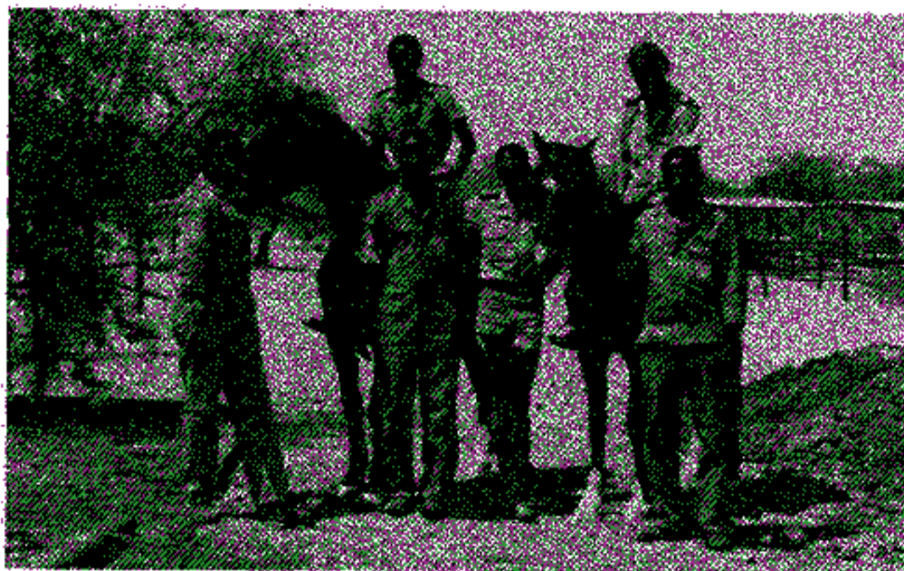
SAVE saddles with the anti-poaching unit, Etosha