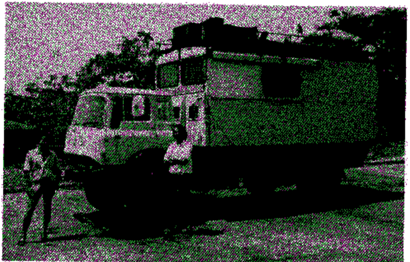
The BP/SAVE truck.