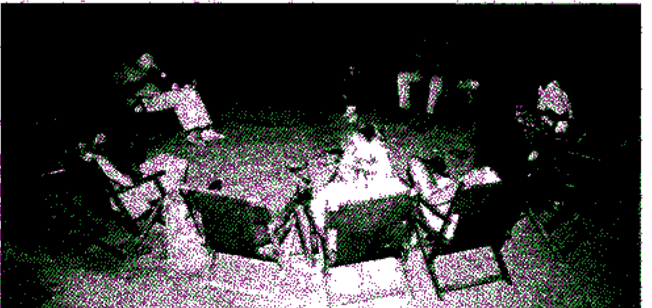
Discussing the evening's play.