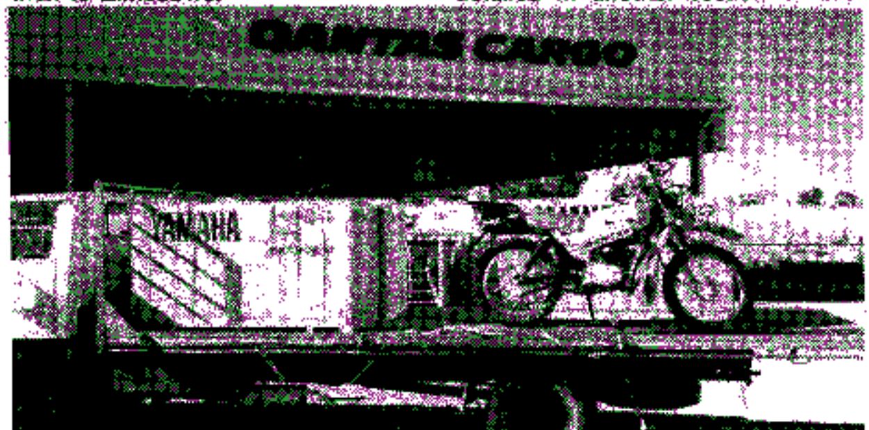
6 motorbikes bound for Zimbabwe.

Our fundraising in the past few months has been fairly minimal and is detailed in another section of this