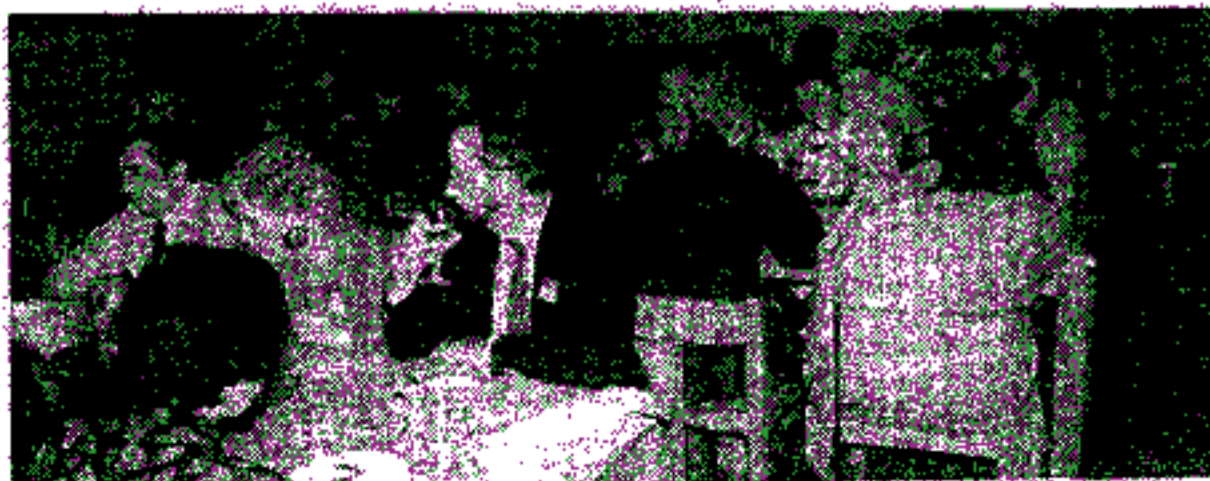
Dinner at Zebra's African Steakhouse.

varied items from Africa. We again thank all who attended the dinner for their support. To those people who took part in the Auction and were successful with their bids, we hope you are enjoying your purchases. We raised approximately $5000.