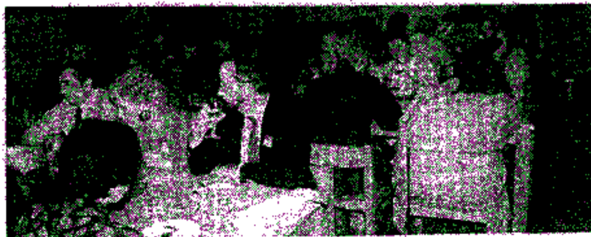
Dinner at Zebra's African Steakhouse.

varied items from Africa. We again thank all who attended the dinner for their support. To those people who took part in the Auction and were successful with their bids, we hope you are enjoying your purchases. We raised approximately $5000.