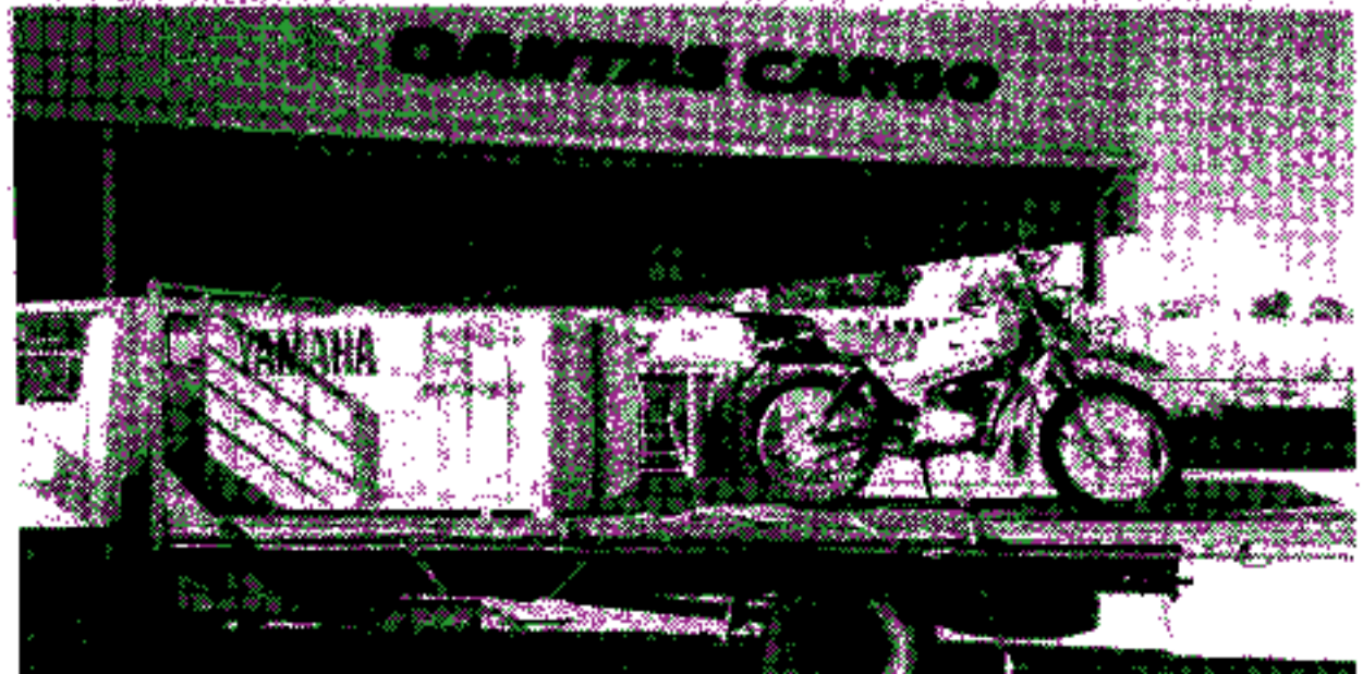
6 motorbikes bound for Zimbabwe.

Our fundraising in the past few months has been fairly minimal and is detailed in another section of this