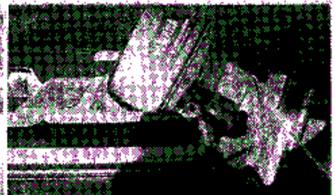
● One of SAVE's outboards at Matusadona, Lake Kariba.