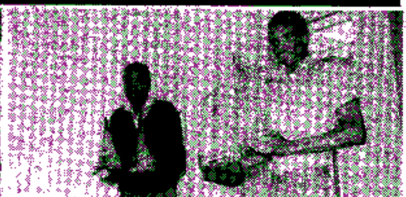
The tragic result of poaching at Chizarira.