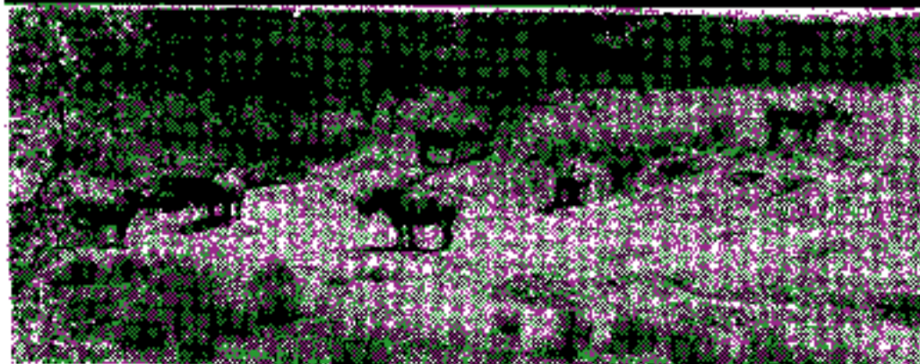
7 young rhinos in their natural habitat.