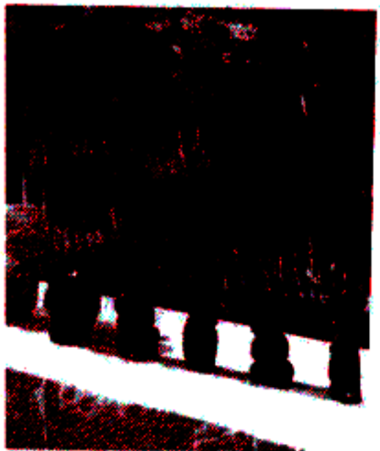
Wardens of Bishop's House