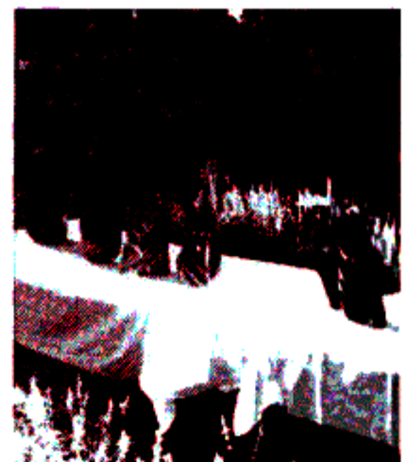
Shona carvings and g.